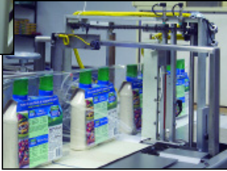
Vertical Sealing System