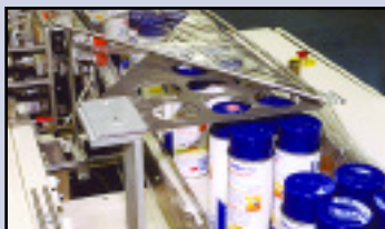
TS37 Wrapping Aerosol Cans