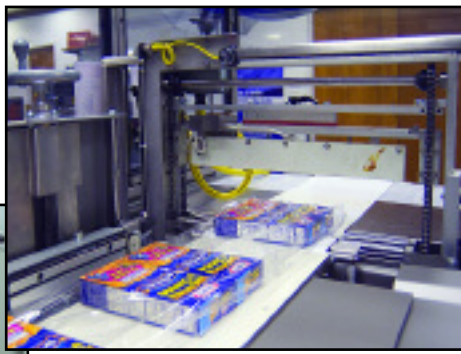
Horizontal Sealing System