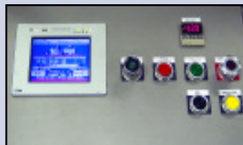
User Friendly Operator Controls