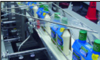
TS37 Wrapping Multi-packs of Salad Dressing