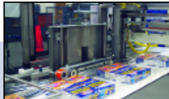
TS37 Wrapping Boxes of Macaroni